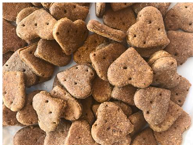
Fig. 2. Insect flour dog treats.

Participants were asked to pick the dog they have the closest relationship to when answering the questions. If they did not have a favorite, they were asked to designate one.